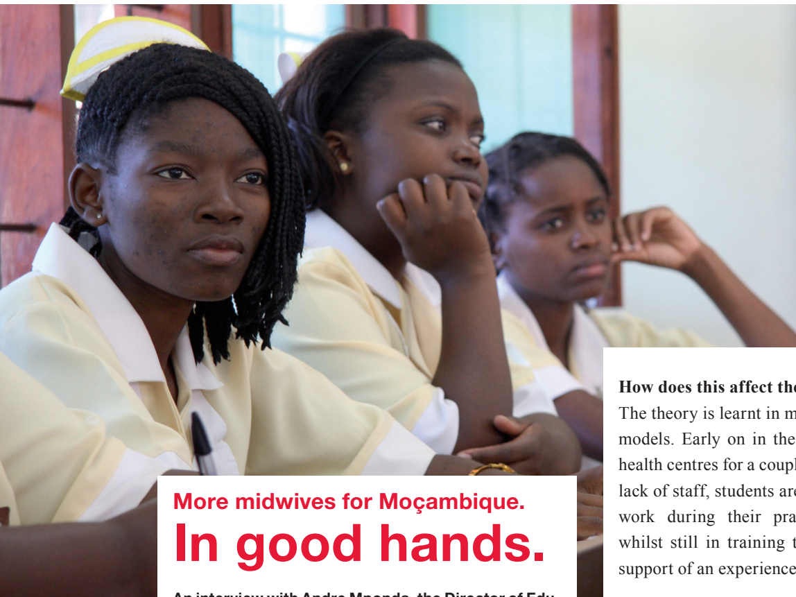
Students of the nursing school in Pemba during theory classes.