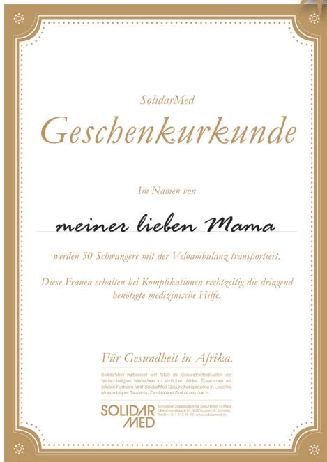
An example of a bicycle ambulance gift certificate ( in German)

Now available online: order your gift donation with gift certificate: www.solidarmed.ch