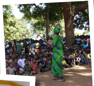
During the community meeting in Matequite ...