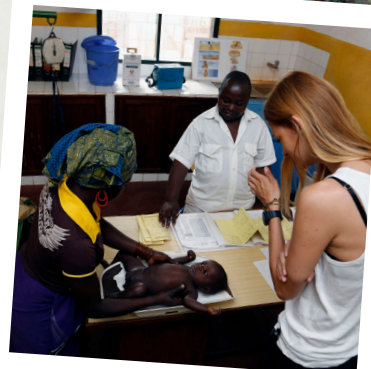
A mother with her baby during the first medical check-up