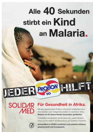
The poster for the 2012 SolidarMed donation appeal