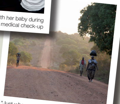
"Just when you think there is nothing here ..."