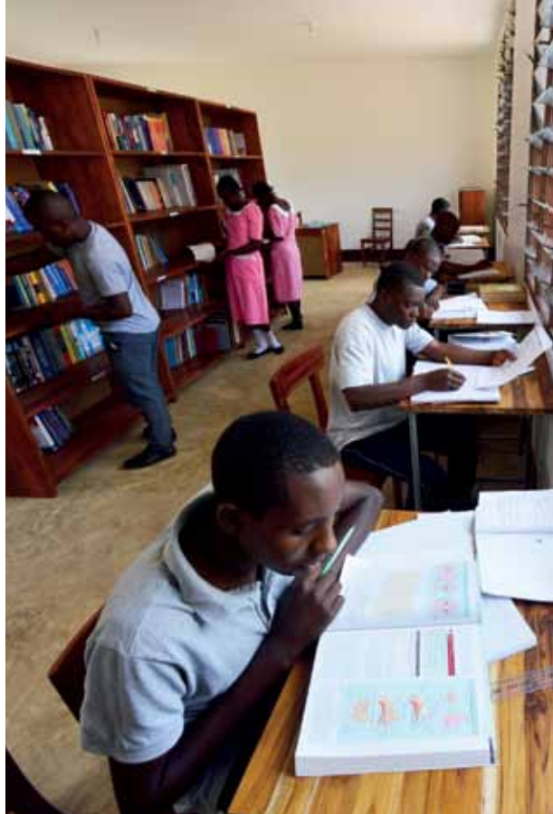
The school library, equipped by SolidarMed.