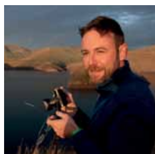
Nik Hartmann, radio and TV presenter