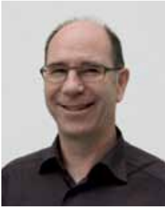
Dr med Svend Capol, President of SolidarMed

When I moved to Finstersee in the canton of Zug in 1997, our village had a shop, a post office, a school, a restaurant and a church. Today, we face the closure of the school. The post office, shop and restaurant have already gone. Although these developments are painful, thanks to cars and public transport, they are bearable.