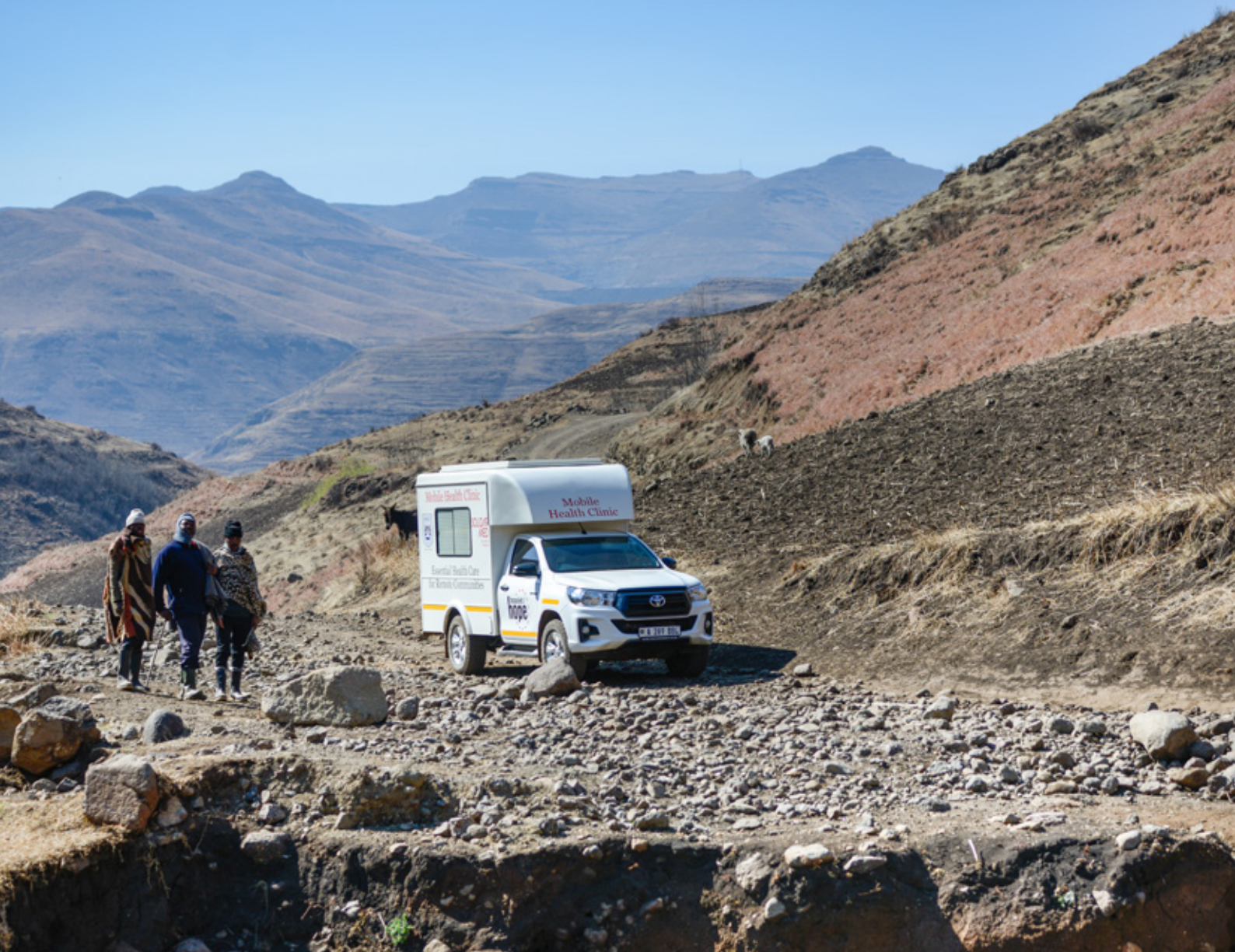
▲ The robust clinic on four wheels is capable of traversing Lesotho's rugged and mountainous terrain. my

including HIV testing and treatment, maternal and neonatal care, including pregnancy check-ups and important vaccinations for children, as well as screening and care for non-communicable diseases such as diabetes and hypertension.