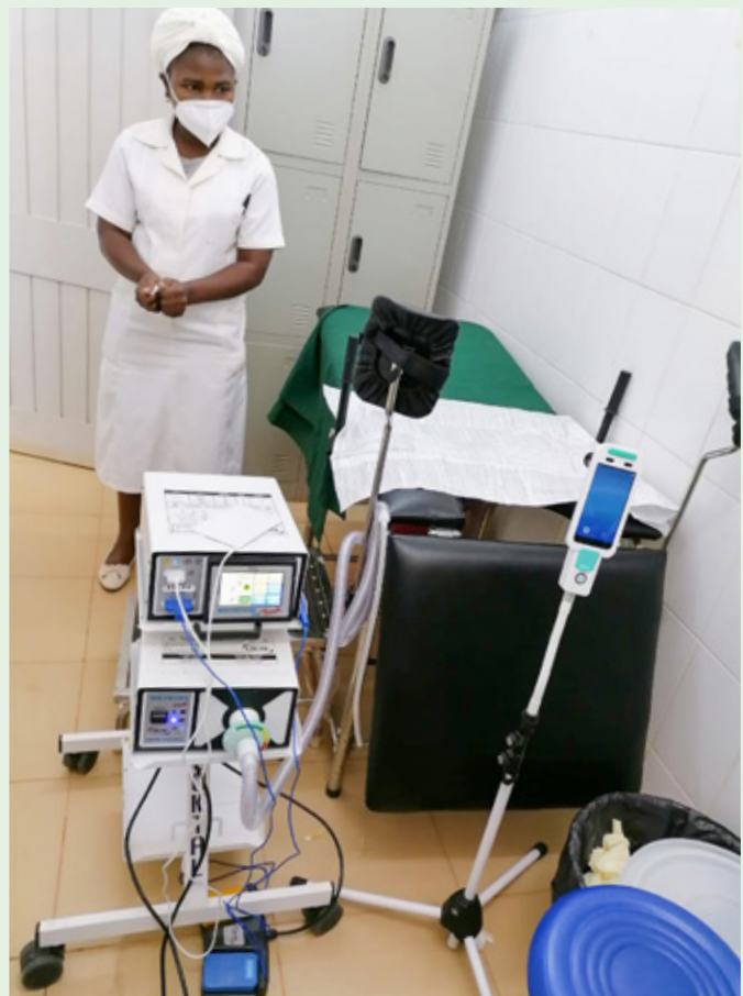
▲ A nurse in a gynaecological examination room set up by SolidarMed. pma