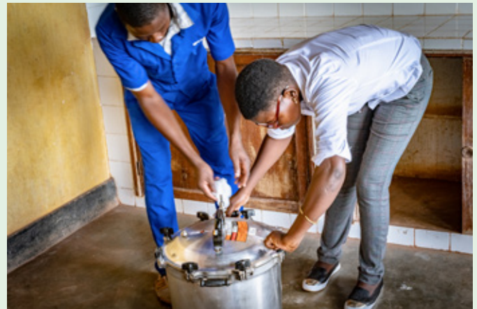
▲ Staff being trained on the use of steam sterilisers. rs

Switzerland/Tanzania As an accredited programme partner of the Swiss Agency for Development and Cooperation (SDC), SolidarMed entered into an alliance with the Geneva-based organisation Enfants du Monde at the beginning of 2021. Through such alliances, the SDC intends to promote cooperation between different actors in the area of development cooperation. Enfants du Monde is a strong partner, particularly in the area of education for children and young people with a focus on Western Africa and South America. Thanks to the alliance and partnership, new and effective programmes can be developed jointly. An initial joint project is currently being planned in Tanzania, where young people are often insufficiently informed about issues relating to sexuality, contraception and pregnancy due to a lack of relevant health services. A frequent consequence of this is teenage pregnancy. From 2022, the project aims to promote sexual and reproductive health and the associated rights of young people in the Ulanga district, through better knowledge and high-quality health services. For this project, SolidarMed brings experience and expertise in delivering medical services in Tanzania, while Enfants du Monde facilitates quality education programmes for young people on sexual and reproductive health. ■ pm