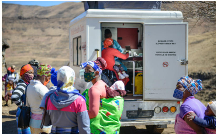
▲ Women and children wait outside the mobile clinic in Phokojoe-Khoaba, a remote village in the mountains. my